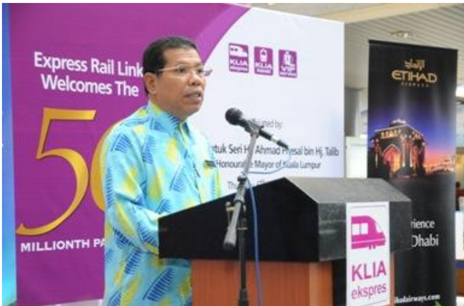
Mayor of Kuala Lumpur, YBhg. Datuk Seri Hj. Ahmad Phesal bin Hj. Talib giving a speech during the event.